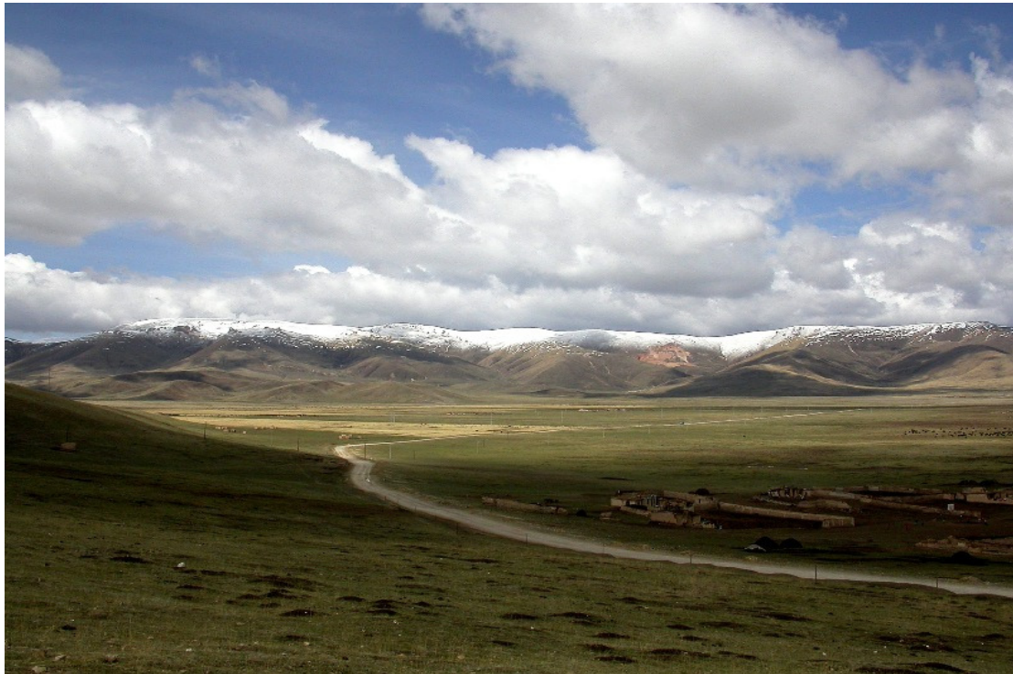
Huang He Shouqu Nature Reserve (CN166) is located in the Tibetan region of southern Gansu and is connected to Zoigê Marshes (CN182) in Sichuan.

Key: ● = Protected; ○ = Partially protected; ○ = Unprotected.