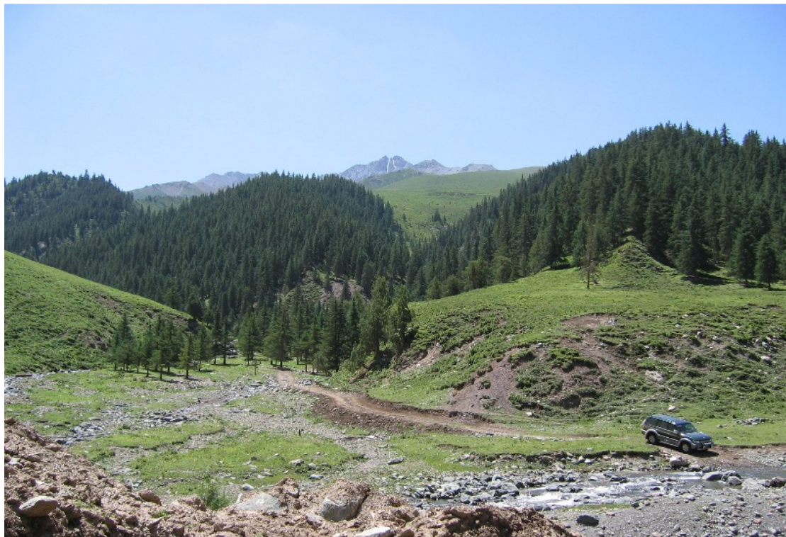
The Dunhuang Nature Reserve and Western Qilian Shan Mountains IBA (CN159) is important for both birds and large mammals.

IMPORTANCE TO OTHER FAUNA AND FLORA: Many protected mammals are found in this nature reserve, such as Snow Leopard, Lynx, Mongolian Wild Ass, Tibetan Wild Ass, Wild Camel etc.